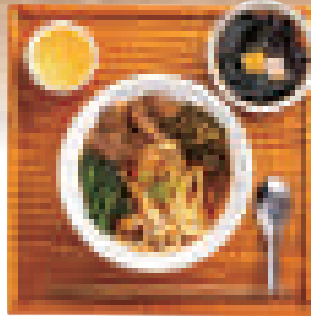
Beef noodles set meal 1,680

Value set meal with beef noodles and braised pork rice