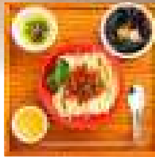
Soupless noodles set meal 1,280

(soup • selectable mini desserts • weekly Taiwanese tea with free refills)