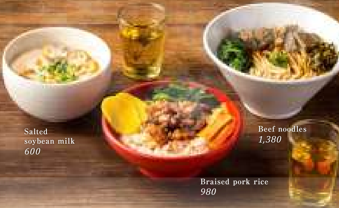
Salted soybean milk 600