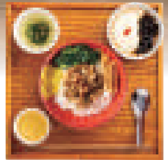
Braised pork rice set meal 1,280

(soup • selectable mini desserts • weekly Taiwanese tea with free refills)