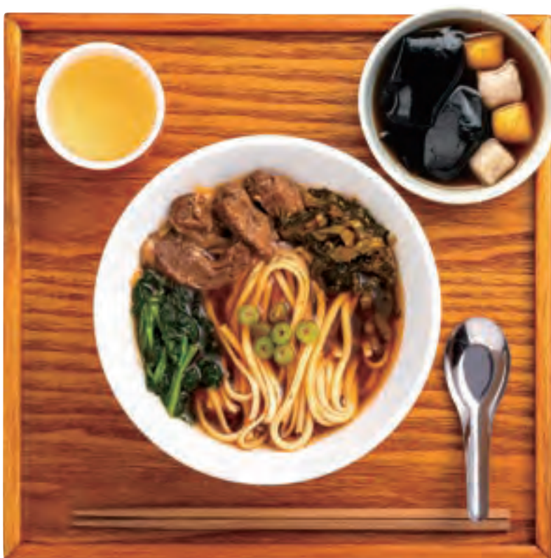
Beef noodles set meal 1,680

〈selectable mini desserts • weekly Taiwanese tea with free refills〉