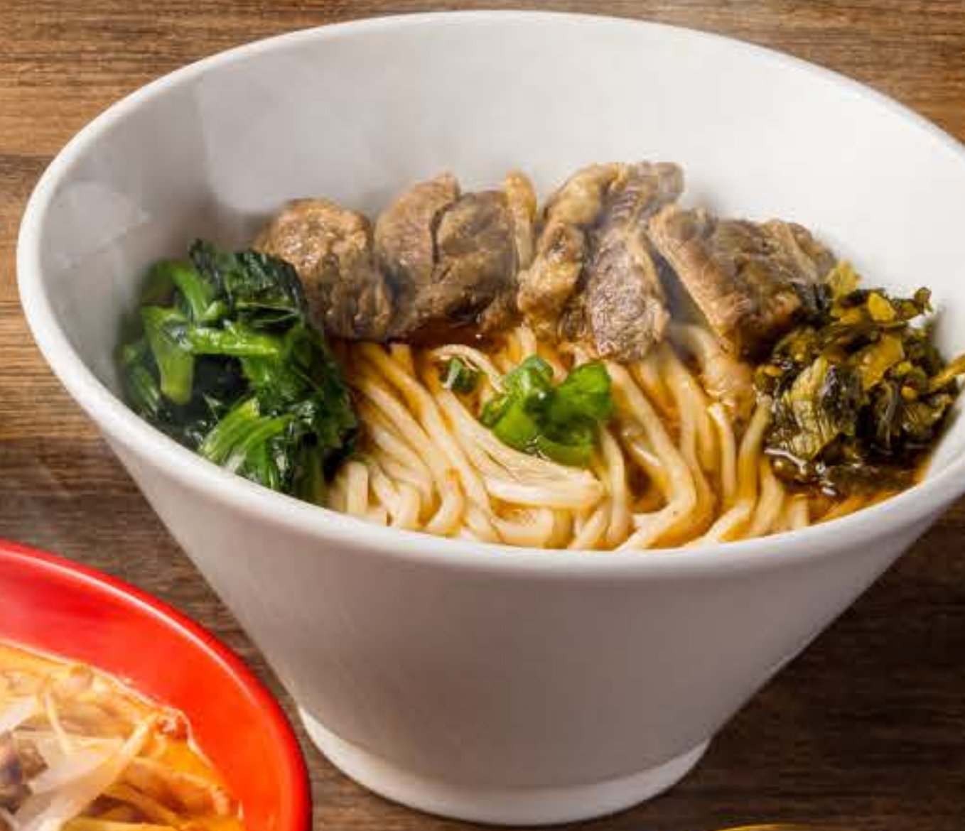
Beef noodles 1,380