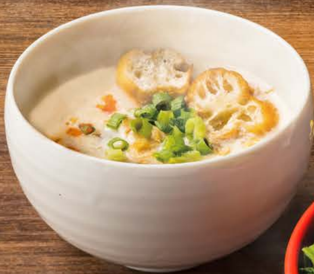
Salted soybean milk 600