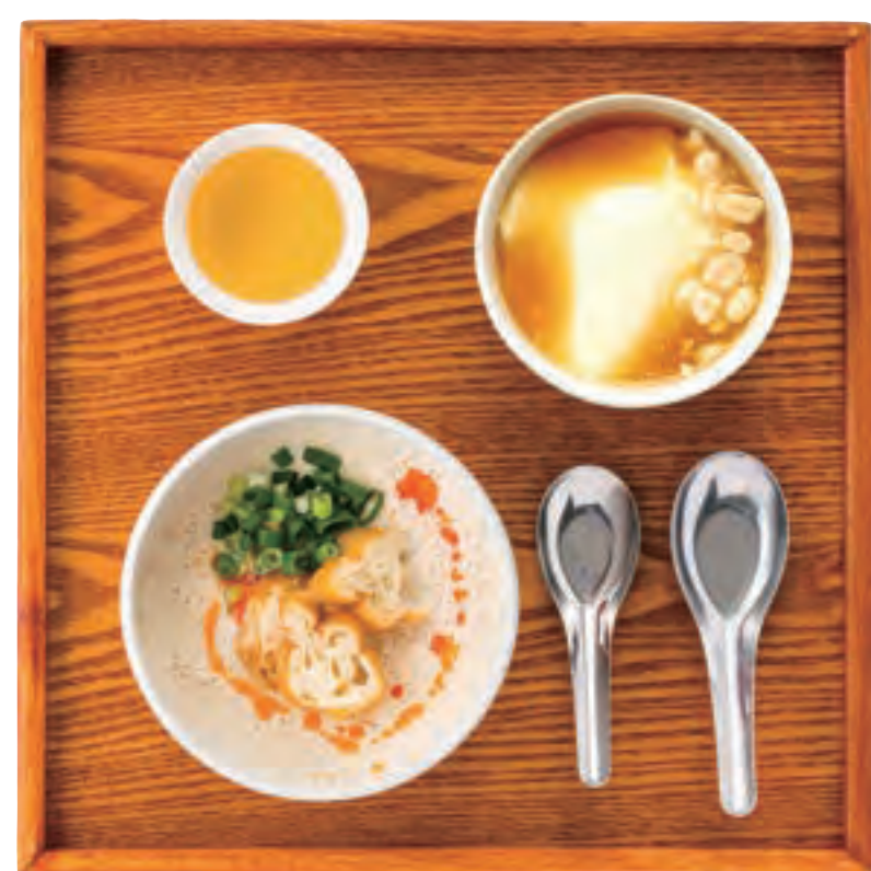
Salted soybean milk set meal 900

Value set meal with salted soybean milk and braised pork rice!