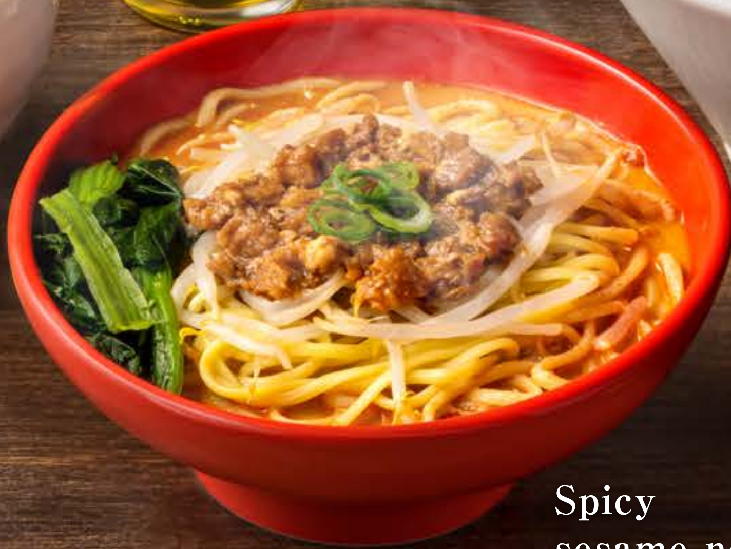
Spicy sesame noodles 980