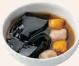
Taro ball & Chinese mesona jelly

Almond tofu pudding Goji berry/Coix seeds