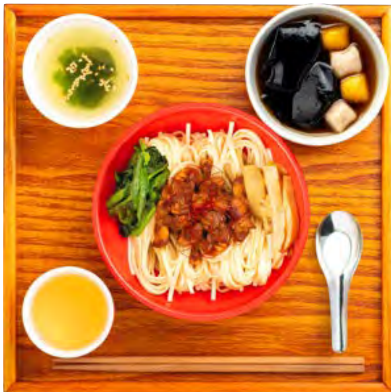
Soupless noodles set meal 1,280

〈soup • selectable mini desserts • weekly Taiwanese tea with free refills〉