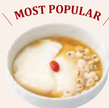
Almond tofu pudding

Please choose one mini dessert for the set meal!