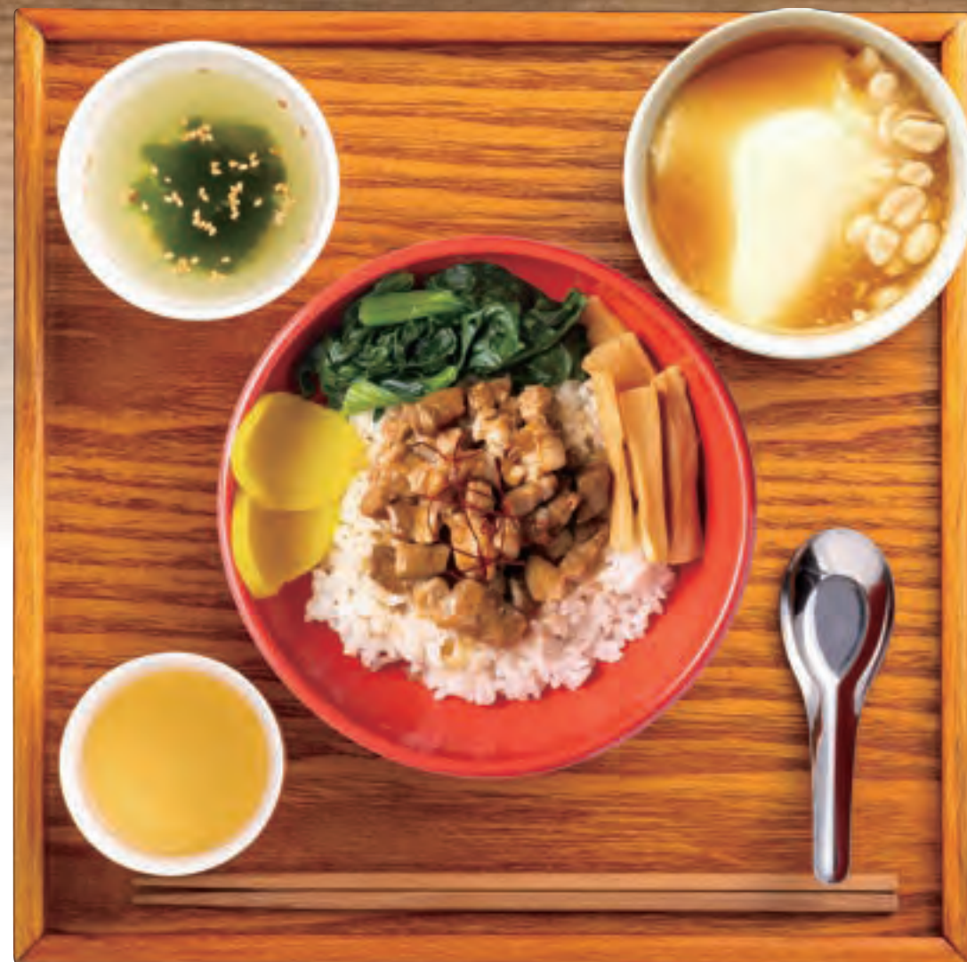
Braised pork rice set meal 1,280

〈soup • selectable mini desserts • weekly Taiwanese tea with free refills〉