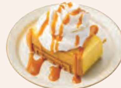
MINI taiwanese castella plate

Taiwanese plane castella Whipped cream/Caramel sauce