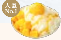
人氣 No.1 芒果綿綿冰